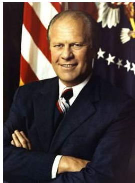
III. Gerald Ford President of the United States

4 th Wednesday Executive Board @ 6:30pm Consistory @ 7:30pm at Harmonia Lodge No. 138 1896 Palm Beach Lakes Blvd, #200 West Palm Beach FL 33409